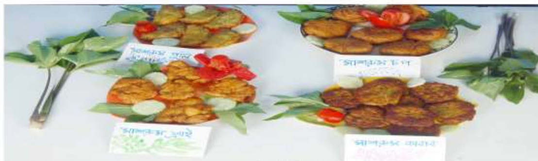
মাশরুমের তৈরী খাবার