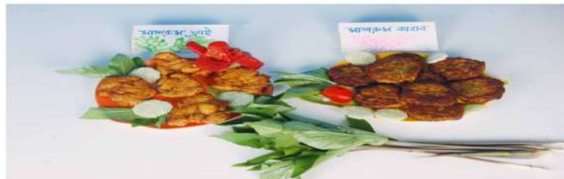
মাশরুমের তৈরী ফাস্টফুড