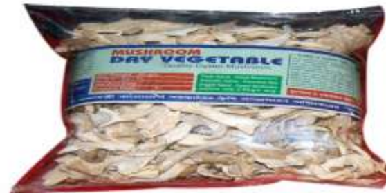
মাশরুম ড্রাই ভেজিটেবল