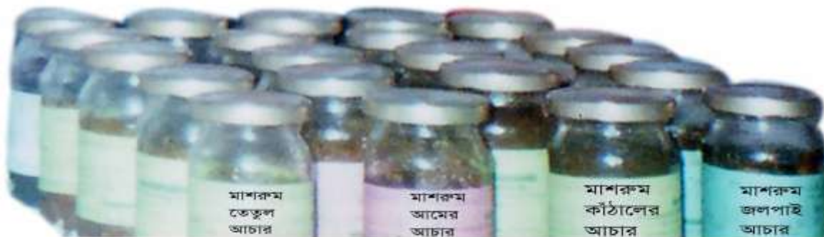
মাশরুম দ্বারা উৎপাদিত বিভিন্ন ধরনের আচার

ময়মনসিংহ রোড (পাওয়ার হাউজের উত্তরে) টাঙ্গাইল।